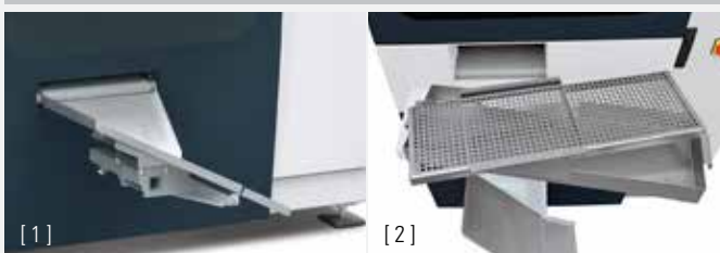
[ 1 ] Parts slide